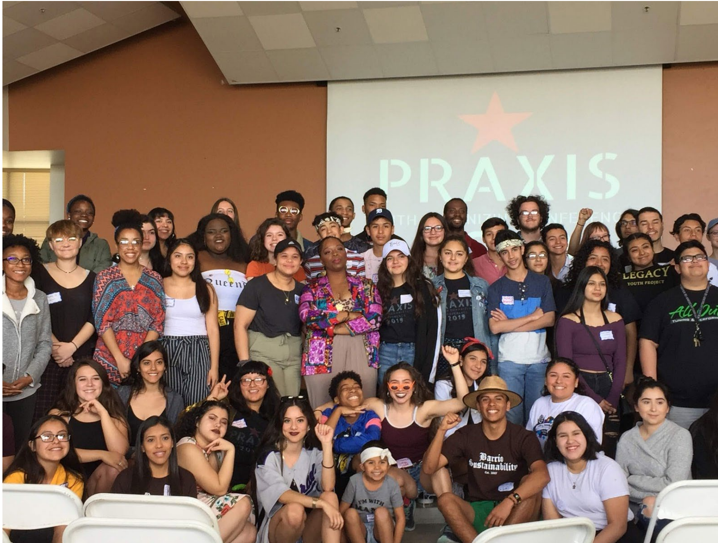
PRAXIS Youth Organizing Conference (Tucson, Arizona)