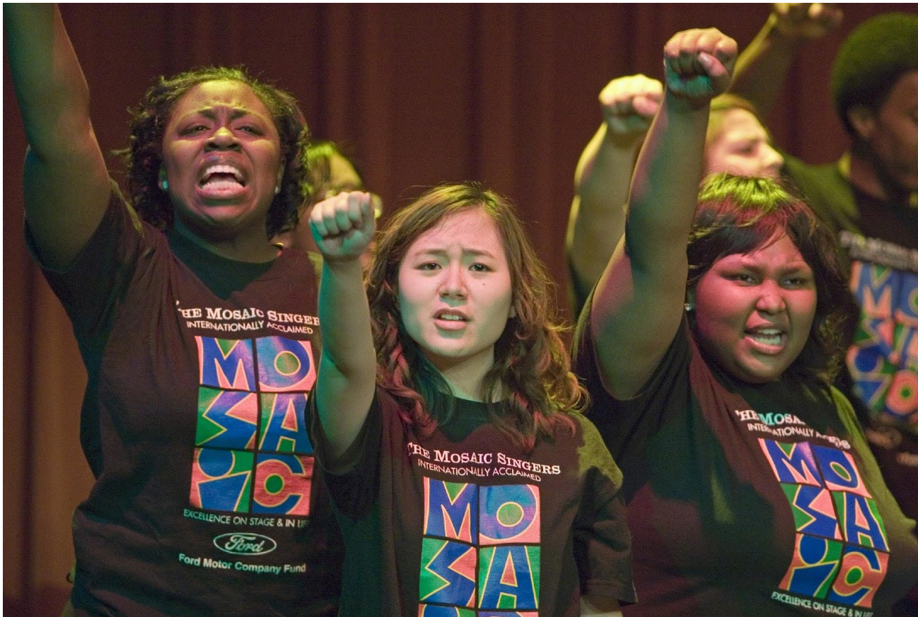
Mosaic Youth Theatre of Detroit

Shifting knowledge production from adult-centered, knowledge-gathering (How much experience do you have? Let me teach you more to prepare you) to youth-centered, knowledge sharing (What type of experience do you hold? Let's combine ours and work together now).