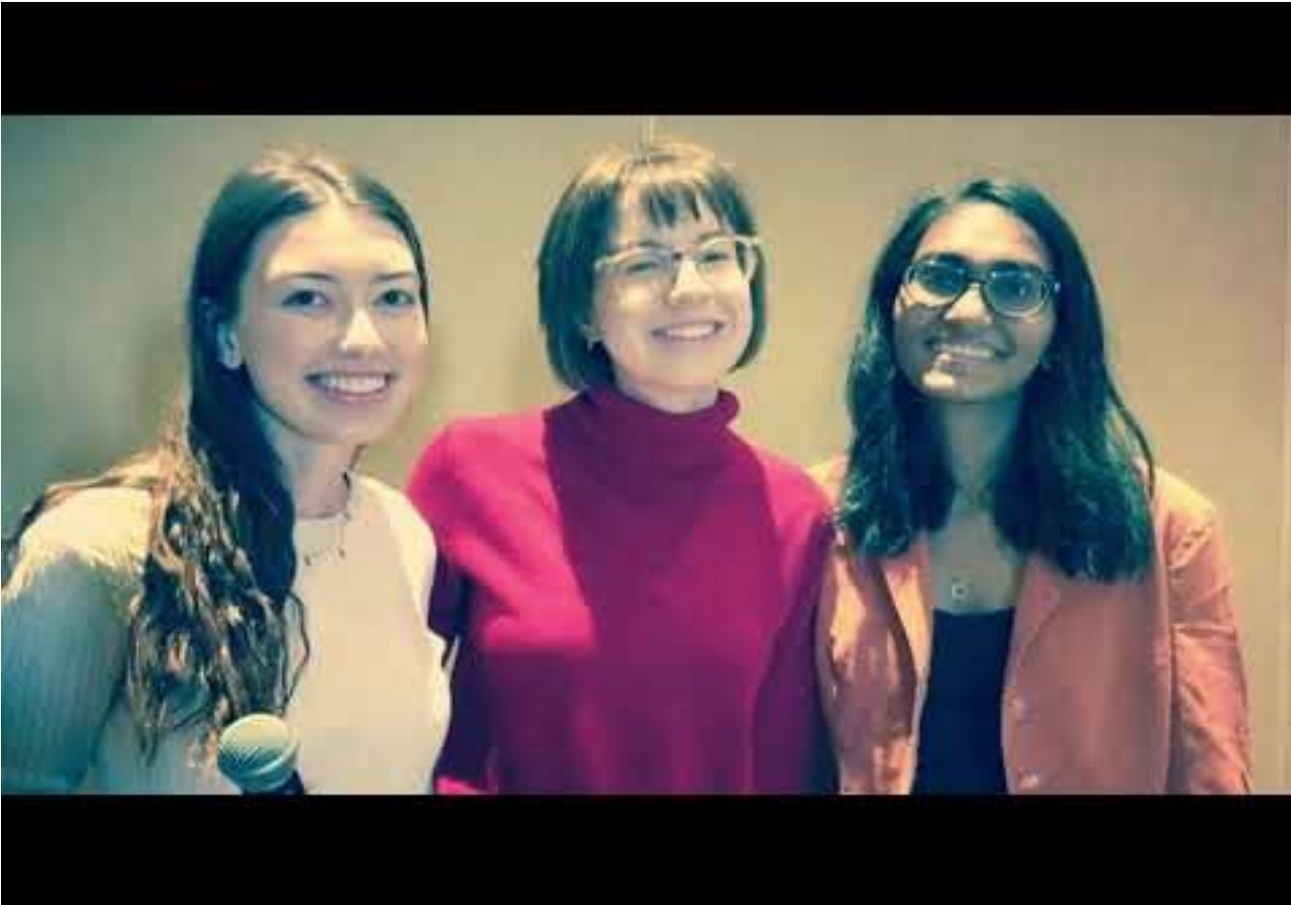
2018 JOINT ARTS EDUCATION CONFERENCE (Phoenix Arizona)

“There is no student who learns and teacher who educates, but a shared power relationship where both who are taught also teach” Paulo Freire